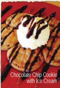
Chocolate Chip Cookie with Ice Cream

Six hot and chewy Chocolate Chip Cookies, topped with Chocolate and Caramel Syrup.